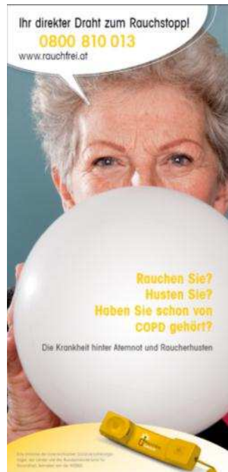
Folder for COPD-Patients