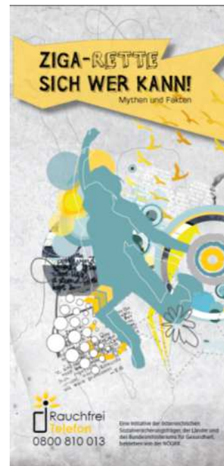
Folder for young people