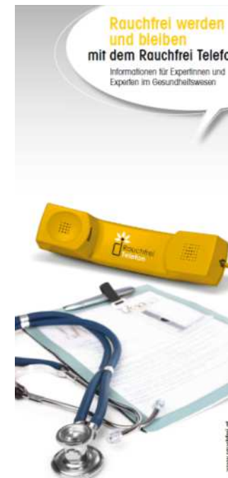
Folder for the cooperation with clinicians