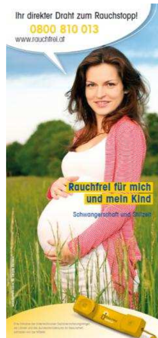
Folder for pregnant women